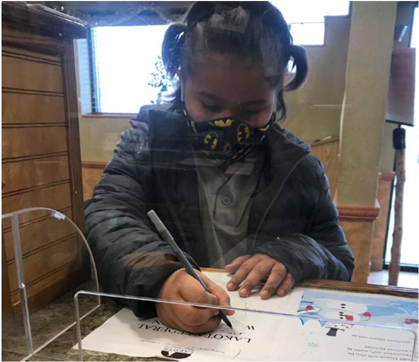
A young Lakota Federal Credit Union member making a deposit into her account.

Federal Credit Union sees itself playing an important role in the community's vibrancy. The credit union is helping its members to have a sense of hope for their futures while providing financial tools to help them get there. One of its brightest beacons of light is seeing young children visit the credit union with their parents or grandparents to make deposits into their savings accounts. This young generation of savers is poised to bring about even bigger economic impacts to the community going forward.